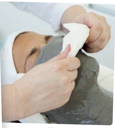
3. Peel off from top to bottom