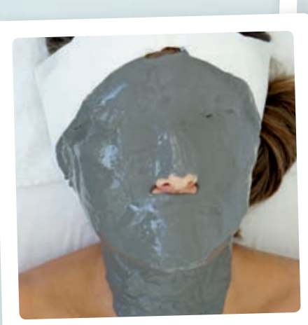
2. Let the mask take its effect